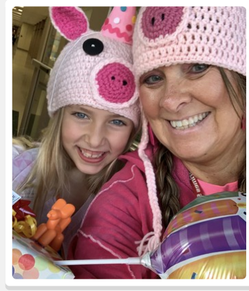
Dress like your favorite book character