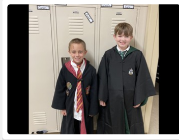
Dress like your favorite book character