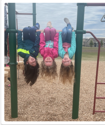
Enjoying the warmer weather at recess!

Please use this link to order your child's school supplies for the 23/24 school year through EPI. If you also have students attending Preschool that school code is HER272 or Optional Kindergarten that school code is SOU168.