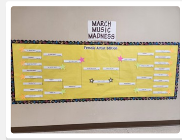
March Music Madness winner announced!

Highlight on Library - Students have one checkout time per 6 day cycle. During checkout the students also have centers in which they can choose the activity they would like to do independently or with others. Some examples of centers are independent reading, puzzles, art center, iPad Apps, and computer choice boards. In addition, I rotate various centers throughout the year. Last quarter the students had options of Legos, 3D books, IO Blocks, I Spy, and magnetic whiteboard.