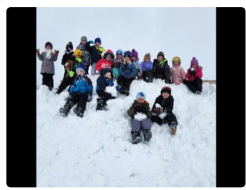
Kindergarten enjoying the snow

Registration for the 23/24 school year will open on February 1st. Please register your students as soon as possible to help the district with up to date student enrollment numbers. Fees for the 23/24 school year can not be paid until July 1st.