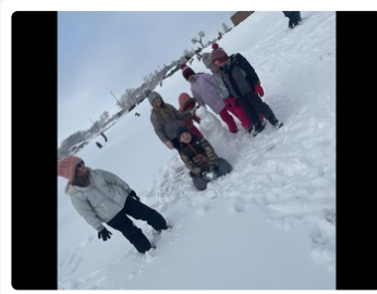
1st grade recess fun