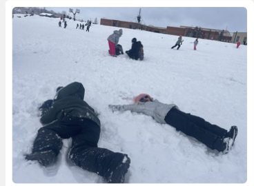
1st grade enjoying the snow